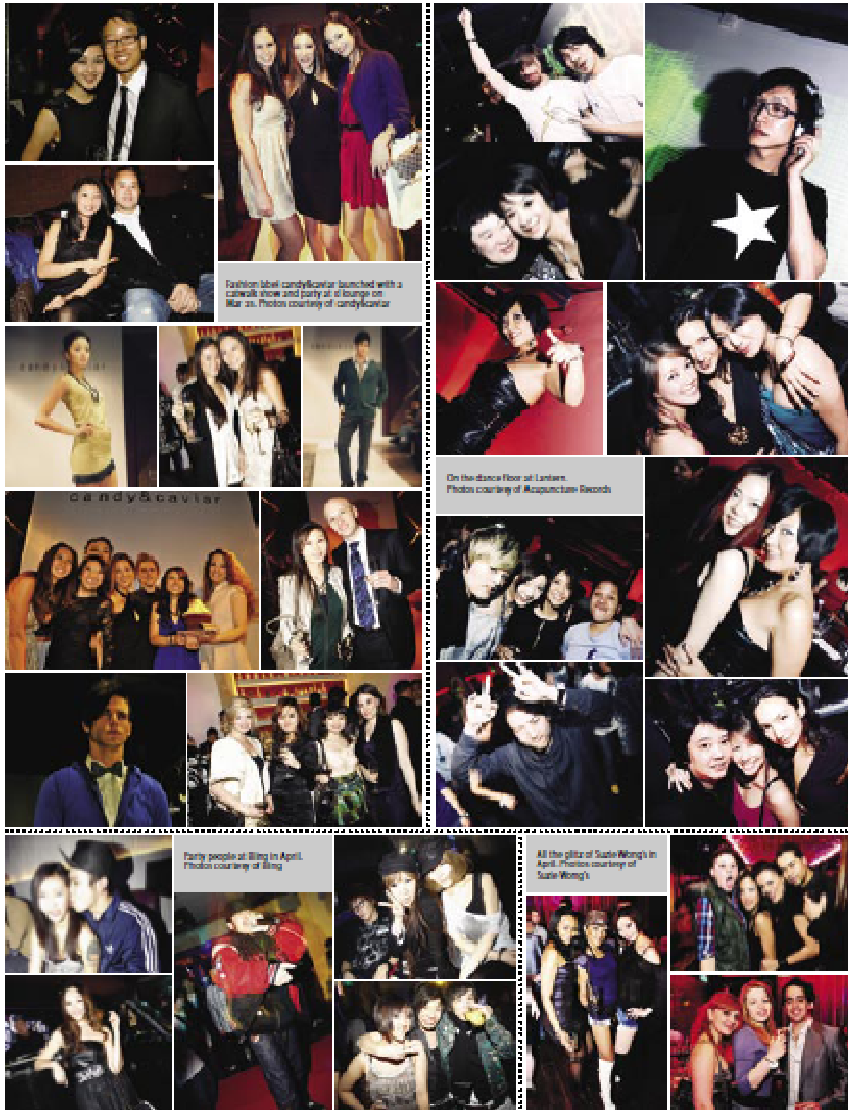
Fashion label candykatz launched with a catwalk show and party at Lil'ing on Mar. 21.